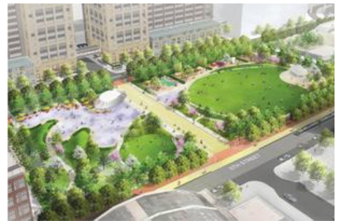
Downtown Commons park has not been finished and has a funding gap of $8 million

"Contrary to public perception, that park is wide open for public use, almost every single day of the year," he said. "Head over there any day. You can punt a football or throw a frisbee as far as the eye can see."